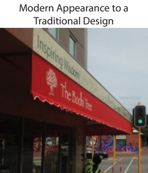
Full Branding Opportunities