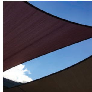
Wide Colour Range Available