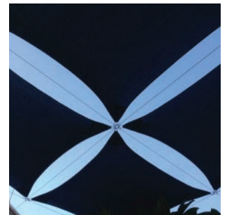
Custom Supports Available