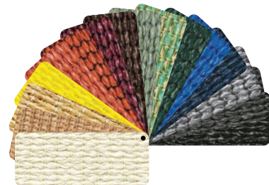
16 Colours Available