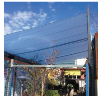
Shade Cloth, PVC or Acrylic Fabric Options