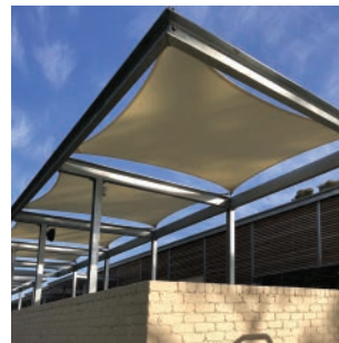
Creating and Enhancing Outdoor Areas