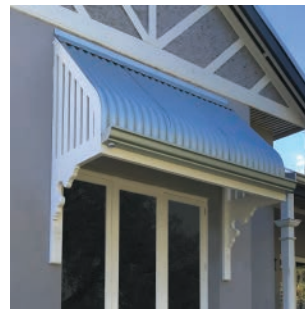
Curved Timber Awning