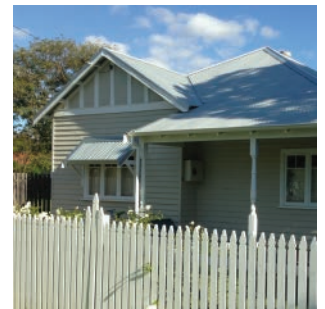
Traditional Design Effortlessly Blends In