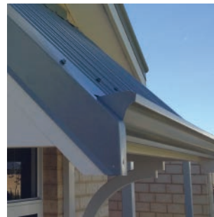
Gutter and Spout