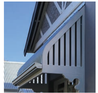
Infill Panels Available