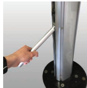
Easy Rotation Locking Handle