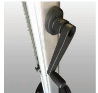
Easy Winding Handle