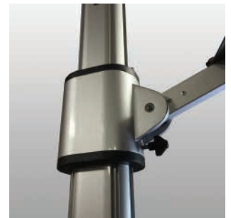
Heavy Duty Slider Car