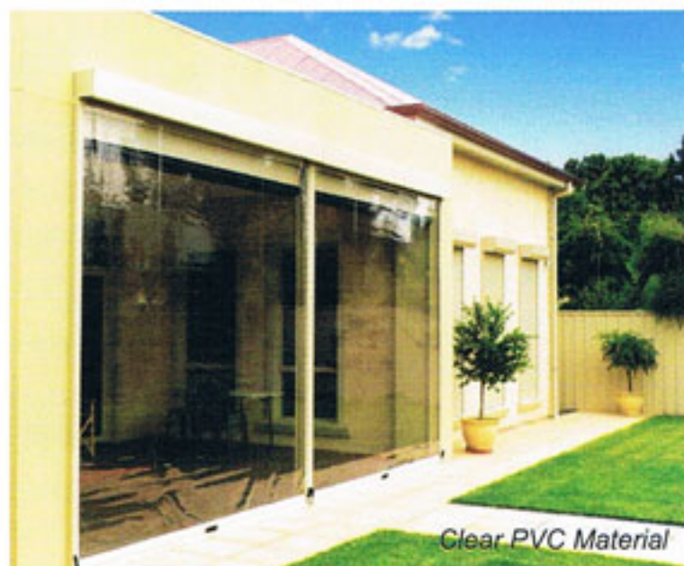
Clear PVC Material