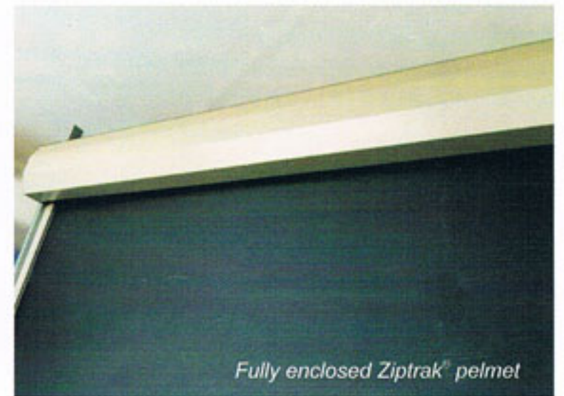
Fully enclosed Ziptrak® pelmet