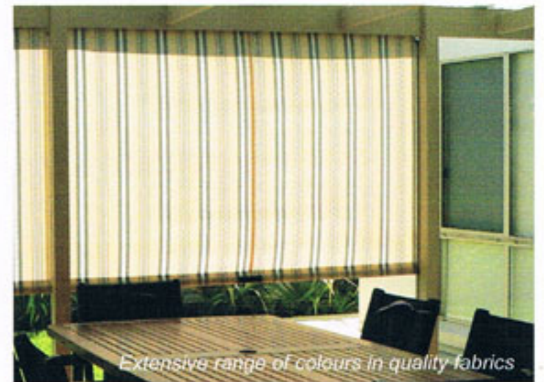
Extensive range of colours in quality fabrics

Discover a simpler way to shade and protect your outdoor way of life.